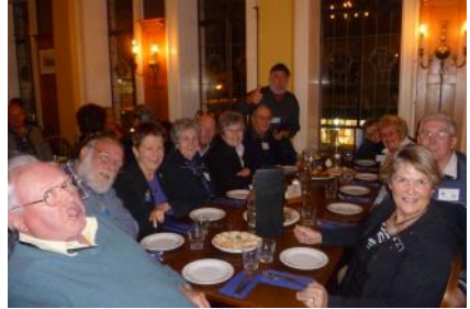
Pasta night with Gore 41 members

Even without the sun, travelling through the rain & mist to Milford Sound was interesting. There were very high rugged mountains, weather worn rocks at the Chasm & reflections of the mountains at Mirror Lake. The Milford Sound Cruise was still worth going on as the waterfalls were fantastic & you could still see the wonderful high mountains ending at the waterline. Another noisy meal at the ‘Moose’ ended a lovely day even though it was then that we found out the volcanic ash was affecting plane travel from New Zealand.