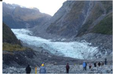
Walking to Fox Glacier

over Mt Cook & the Glaciers. Certainly a trip to remember with the sun shining on the huge snow capped mountains & glaciers. There was plenty to occupy us here. - Kiwis (bird variety), hot pools, interesting Bailey bridge being raised because of the build up of gravel from the glacier & a very friendly pub.