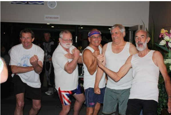
The Aussie Haka Team