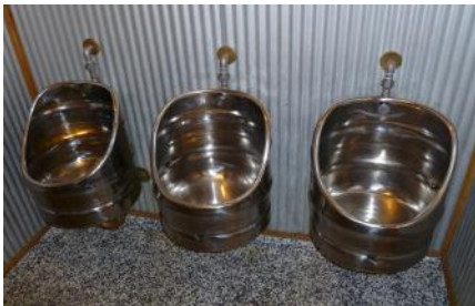
Urinals at Monteith Brewery

Greymouth was our stop for the night with our surprise accommodation. It was a double row of rooms, each with numerous beds, & 3 unisex toilets & showers at the end of the row.