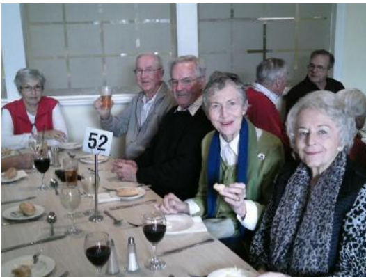
Melbourne / Gippsland

Sadly, the number attending the Rort this year is well down on what would normally be expected and this will be the first time ever, at 36 annual Rorts, that Melbourne-Gippsland will not be represented.